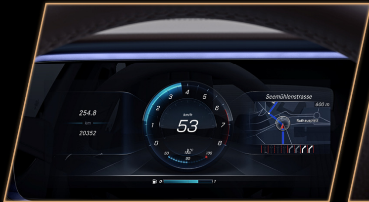
Wide Screen Cockpit

with two 12.3-inch displays and digital instrument cluster with three different styles.