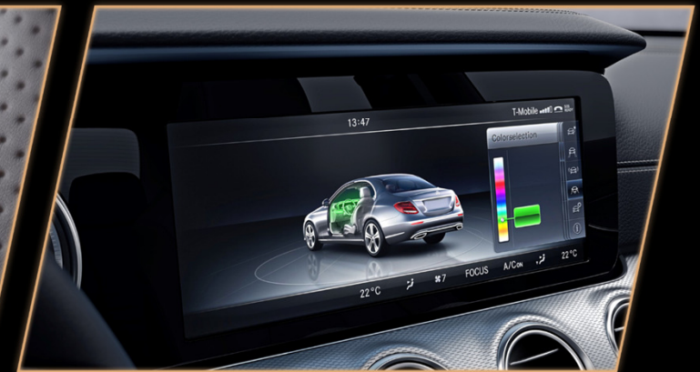
New User Interface

to operate the instrument cluster and multimedia system with the hands at the steering wheel.