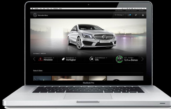
Web (Mercedes me Portal)