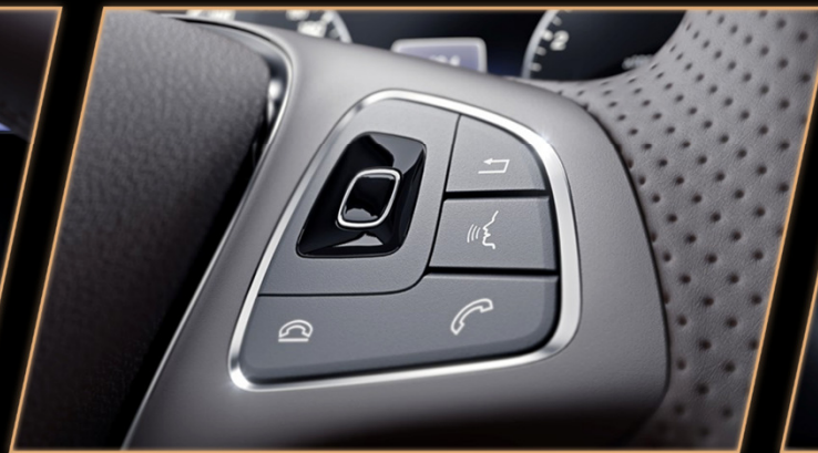
Touch Control Buttons

with two 12.3-inch displays and digital instrument cluster with three different styles.