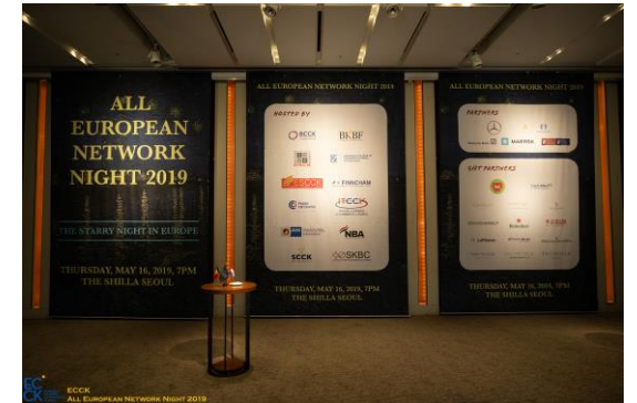
Logo exposure on installed banner