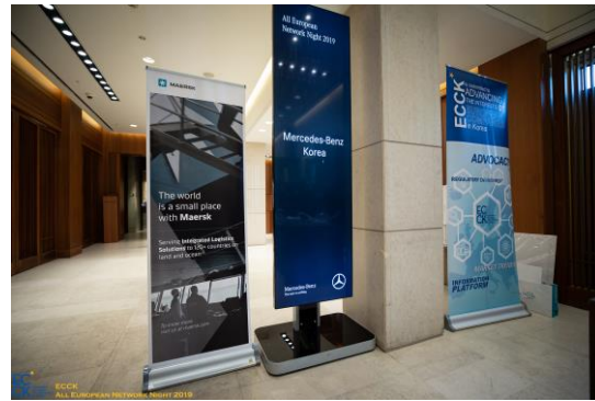
Marketing material in entrance (Banner installation)