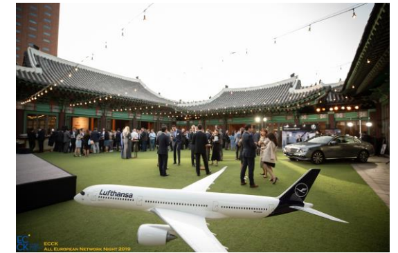
Company promotion desk (Flight, Car display)