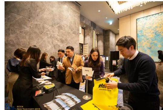
Marketing material in entrance (Give-away distribution)