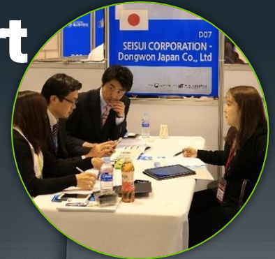
Interpreters available on-site at the purchase consultation meeting

Facilitating networking and business growth between domestic buyers and companies through purchase consultation meetings